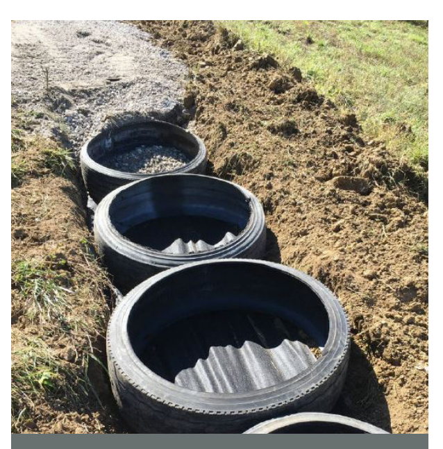
Nonwoven geotextile fabric and tread cylinders are placed in a trench and backfilled with dense grade aggregate (DGA).

An actual tire cylinder may be approximately 40 inches in diameter, but the removal of the tire sidewall will enable the tire cylinder to fit within a 36-inch-wide trench. Nonwoven geotextile fabric should be placed in the bottom of the trench. This material is needed to provide the drainage, reinforcement, friction, and separation necessary for structural integrity. The tread cylinders are then placed end to end, on top of the geotextile fabric. A suitable rock material, such as dense-grade aggregate (DGA), is then placed inside and around the tire voids. The top edge of the tire cylinder should be at grade level or a little higher.