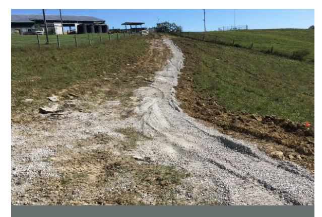
A completed trail leads to water source located on a hill with 30% slopes.

become slippery, plastic, and difficult to traverse. The energy expanded and drudgery experienced by a large animal traveling on a slope can be tremendous. Producers interested in providing a more effective trail should consider implementing an all-weather surface application.