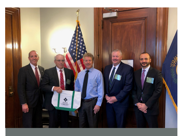
Farm Credit System group photo with Senator Rand Paul.