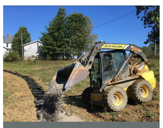
The tread cylinders are filled with rock.

The effort required to install an all-weather surface trail for grazing animals will not be wasted. Grazing animals and their offspring can be seen using these trails during all times of the year. These trails provide energy efficiencies for animals, particularly during wet weather periods.