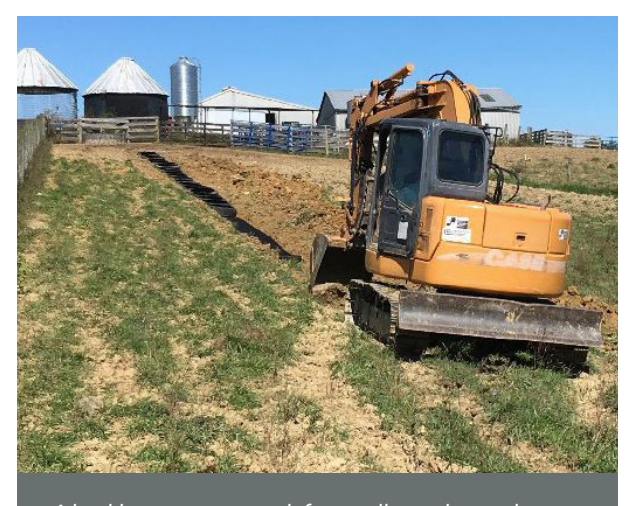
A backhoe cretes a trench for an all weather path.

A second type of trail created by grazing animals, the cow path, is also designed to save energy. At approximately 12 inches in width, these singular trails are the same width as grazing trails, but there are subtle differences between them. Animals can be seen walking these trails in single file without grazing, typically using them to